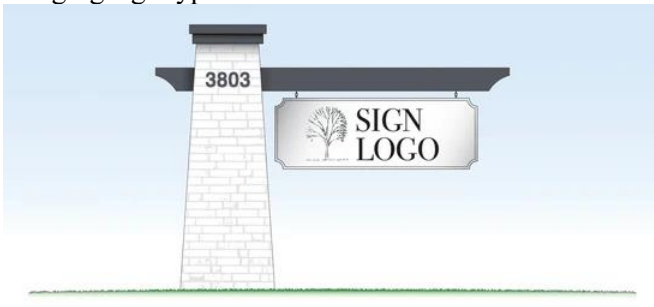
"L" shape slab style sign